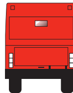
Full Rear Panel